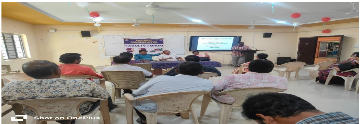
Shot on OnePlus