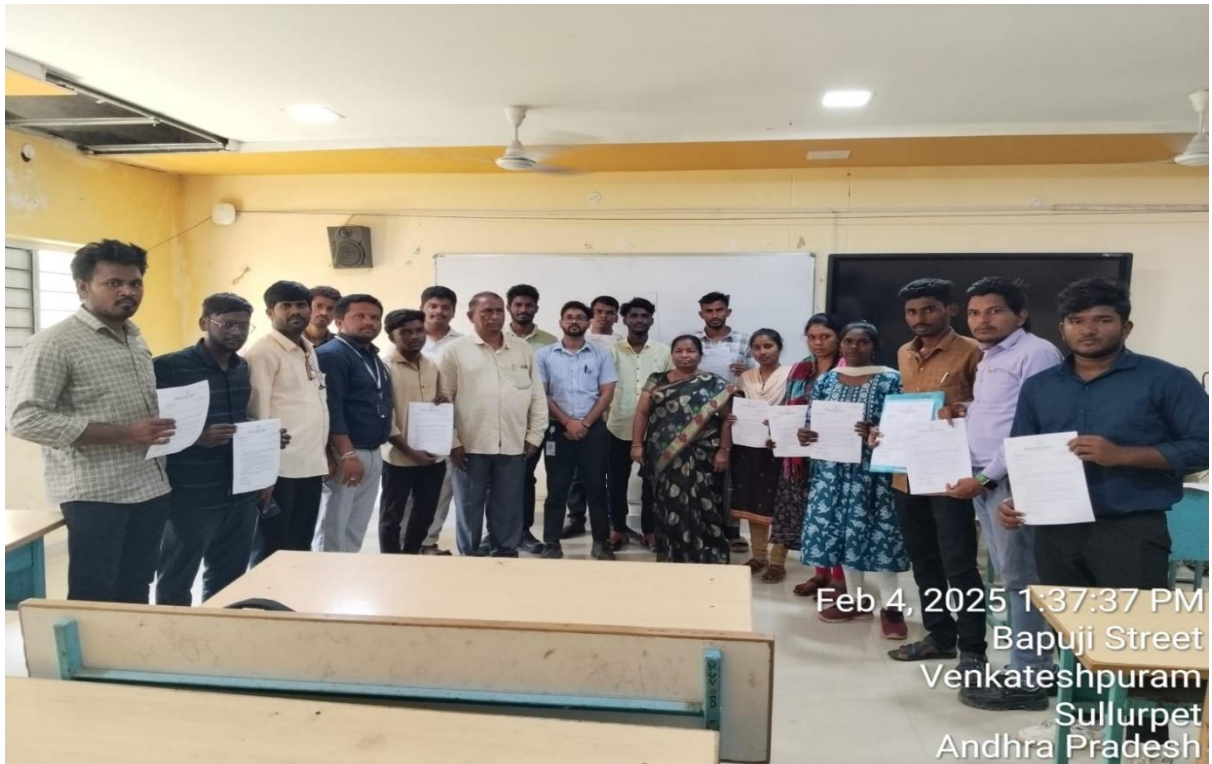
Feb 4, 2025 1:37:37 PM Bapuji Street Venkateshpuram Sullurpet Andhra Pradesh