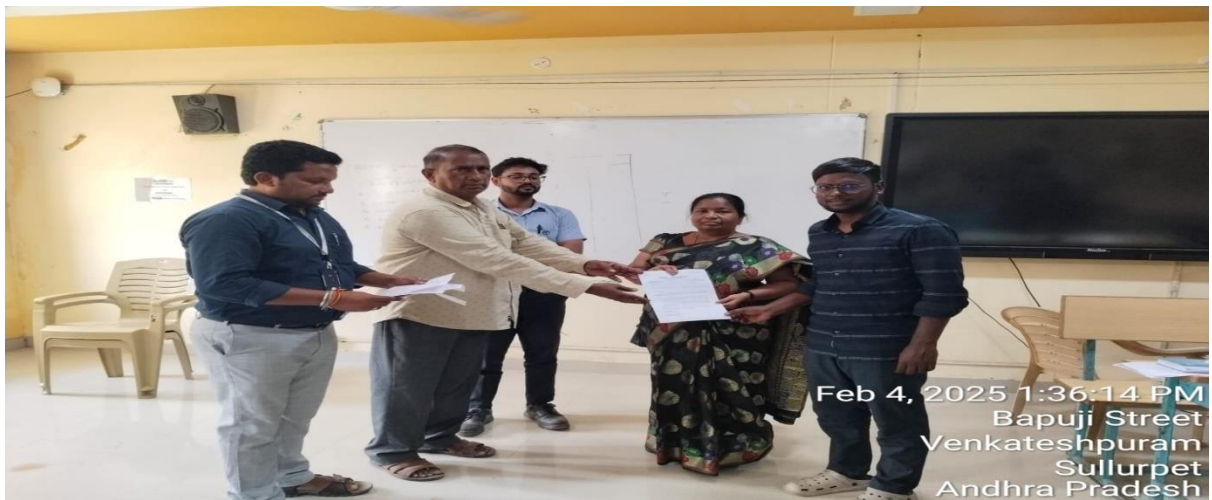
Feb 4, 2025 1:36:14 PM Bapuji Street Venkateshpuram Sullurpet Andhra Pradesh